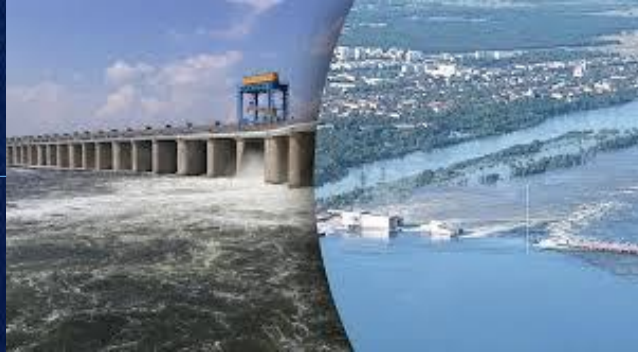
Consequences of destruction